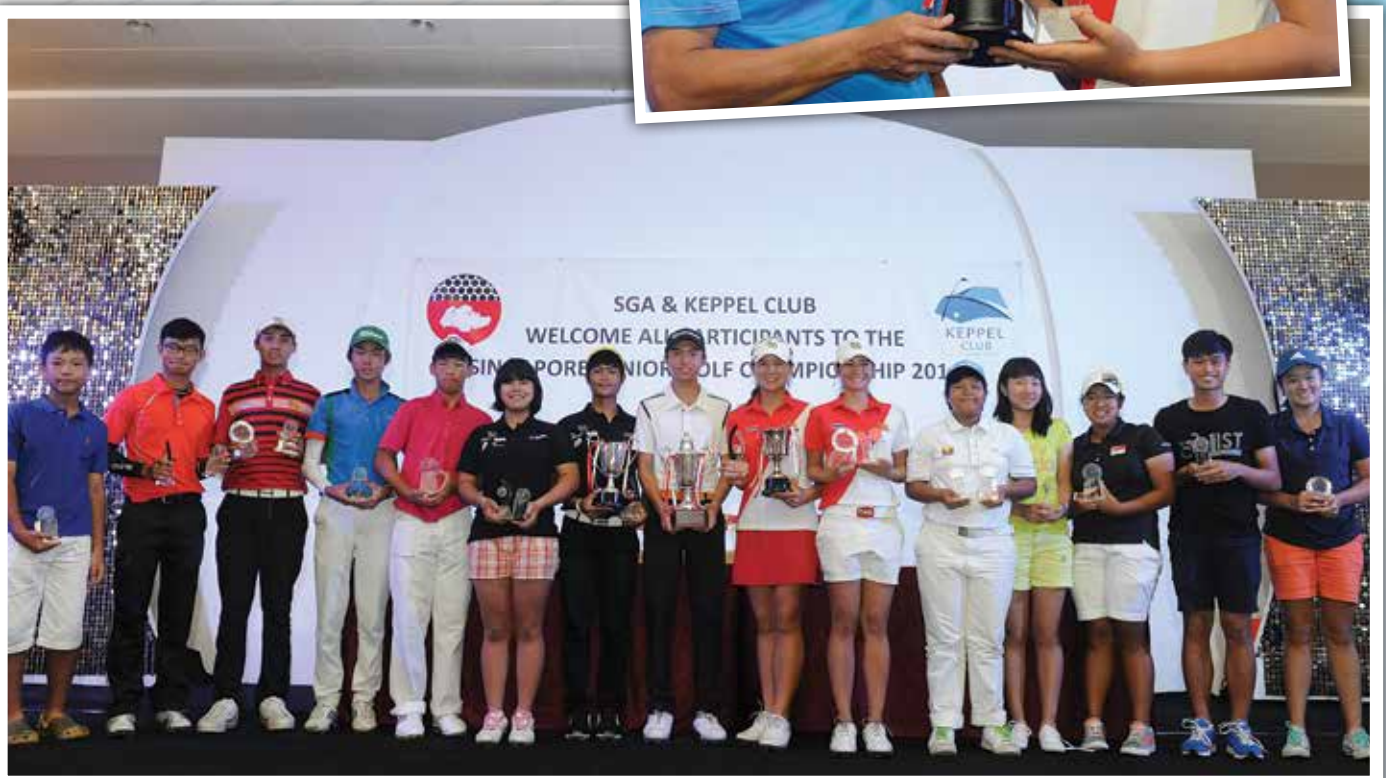
All the winners of the Singapore Junior Golf Championship.