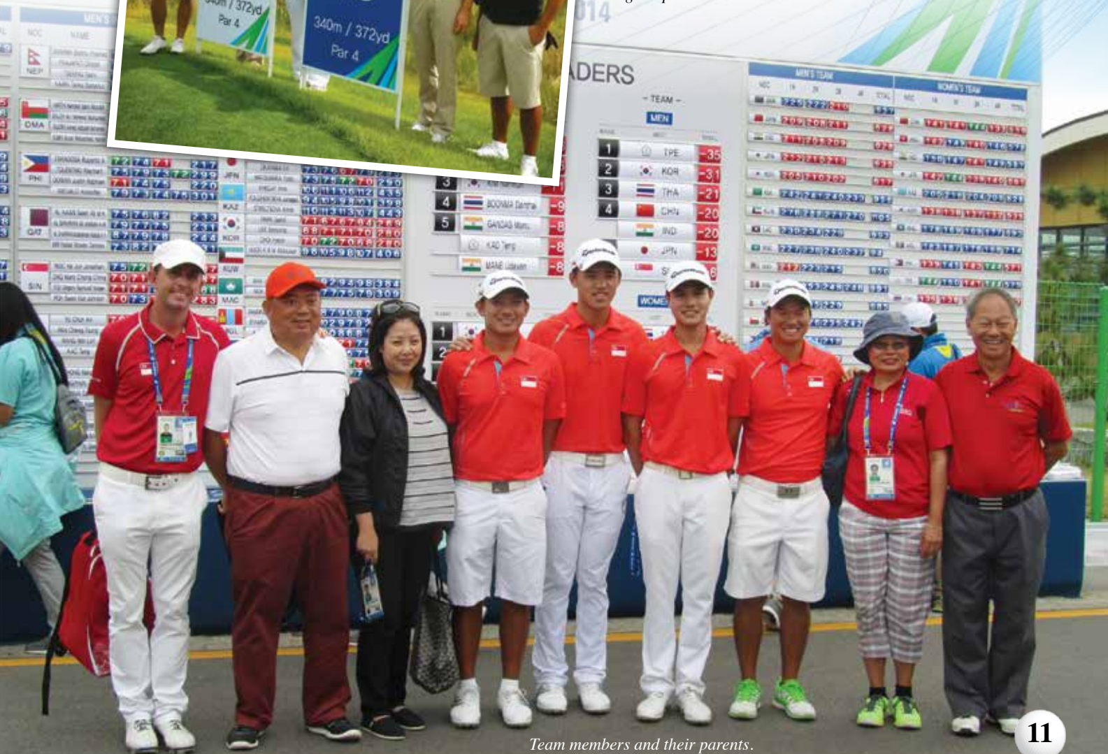
Team members and their parents.