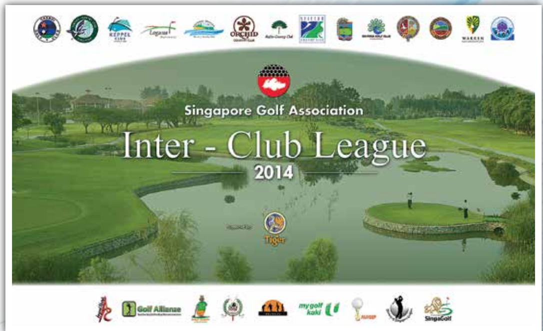
Backdrop at the SGA ICC prize presentation dinner

The SGA Inter Club League continued to enjoy the sponsorship of Asia Pacific Breweries at all the 13 SGA ICL legs as well as at the prize presentation dinner. However, Daimler SEA Pte Ltd decided to cease sponsorship of this event.