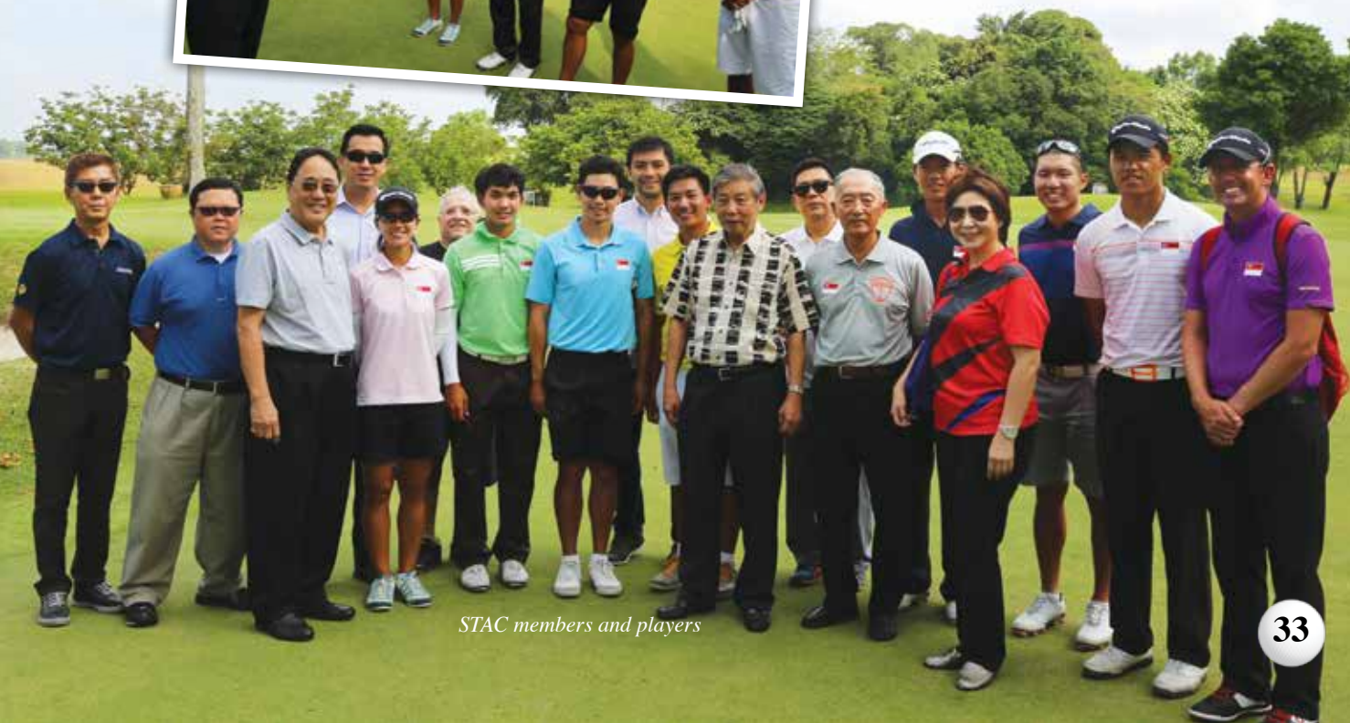
STAC members and players