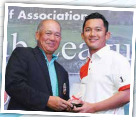
Society of Singapore Golfers – “C” Division Winner