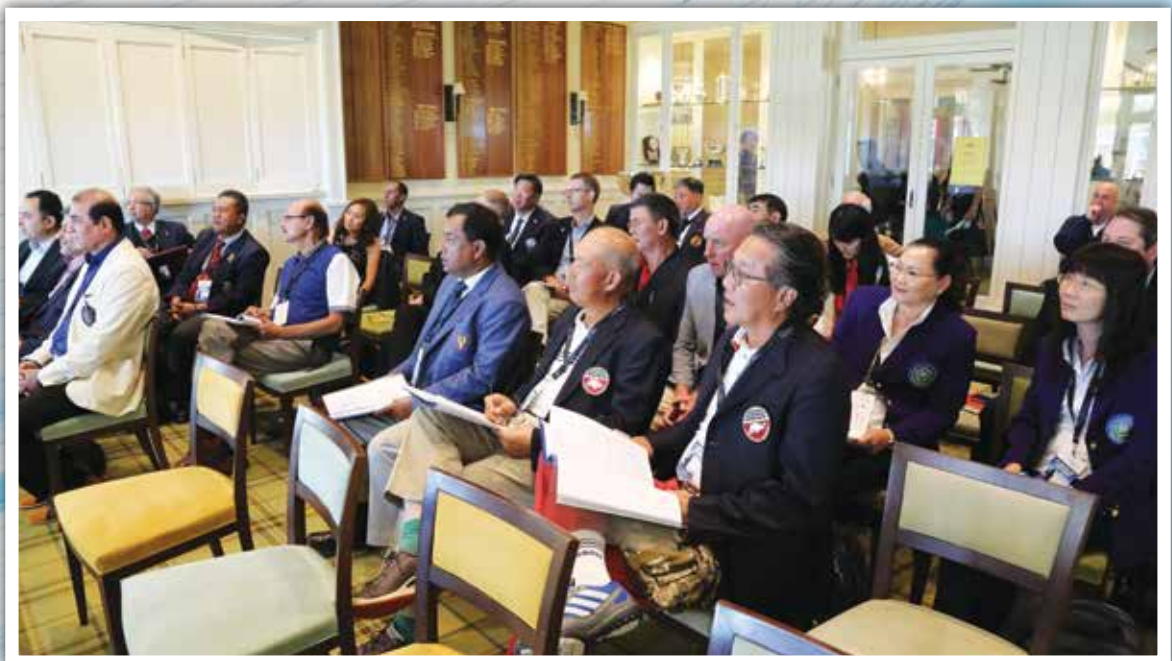
APGC delegates attending the AGM.