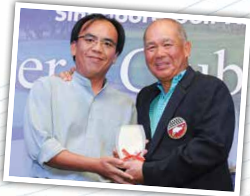
Acers Bon Club – “A” Division Winner

Trophies were also awarded by President SGA to winners of the SGA Inter-Associate Members' League during the prize presentation dinner.