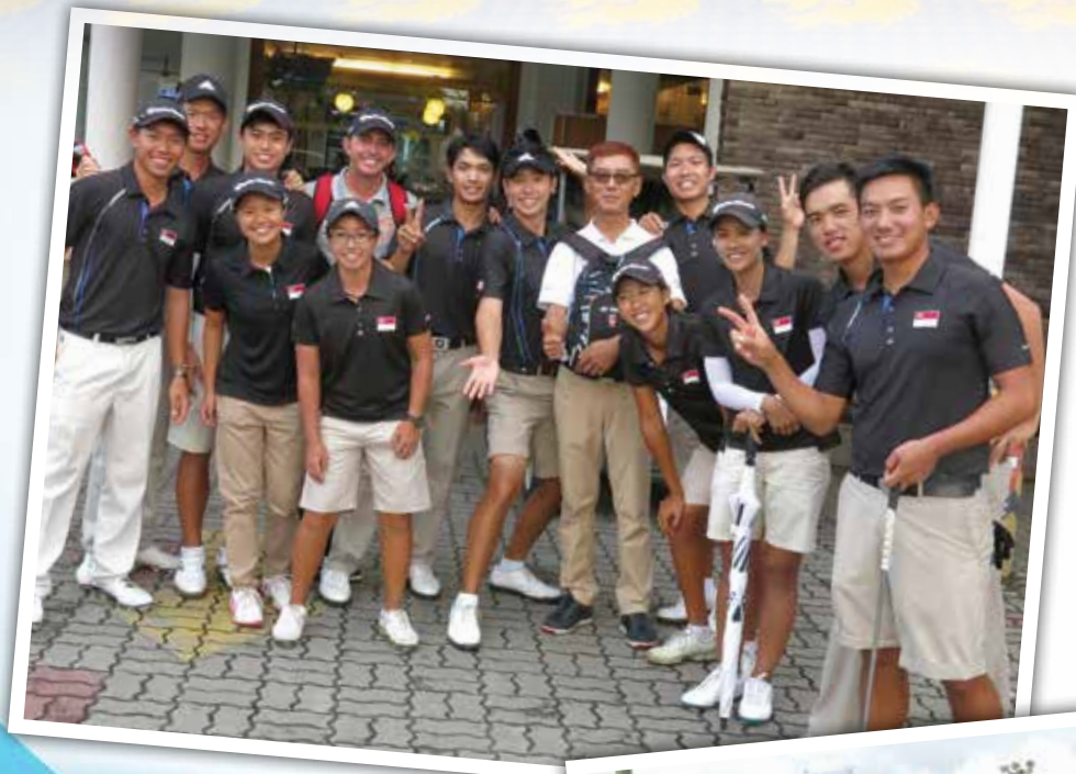
Team SGA on the first day.