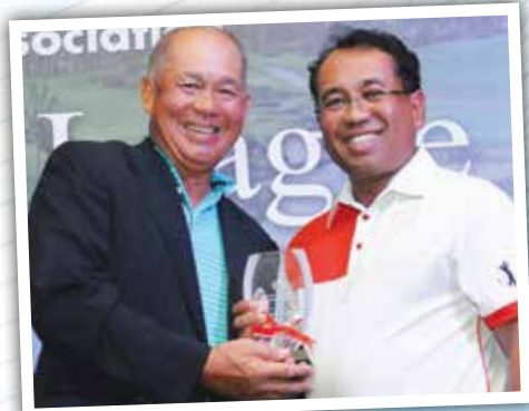
Society of Singapore Golfers – “B” Division Winner