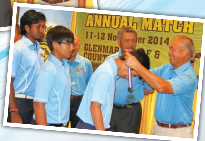
President SGA presenting MGA players with the silver medallion.