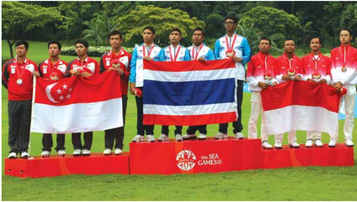
Men's teams on the winners' podium, from left: Team Singapore (Silver), Team Thailand (Gold) and Team Indonesia (Bronze).

Singapore achieved our best SEA Games performance with a podium finish in all four events winning the men’s team and individual silver and women’s team and individual bronze. Indonesia won the women’s team silver and the men’s team bronze.