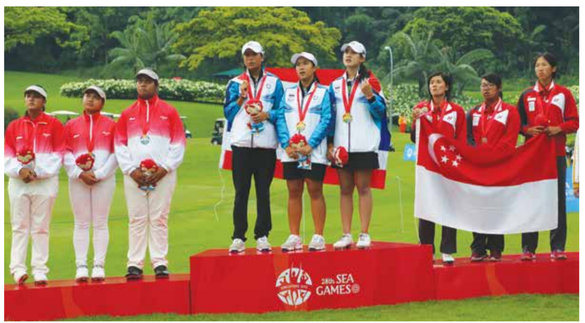
Women's winning teams on the podium, from left: Team Indonesia (Silver), Team Thailand (Gold) and Team Singapore (Bronze).