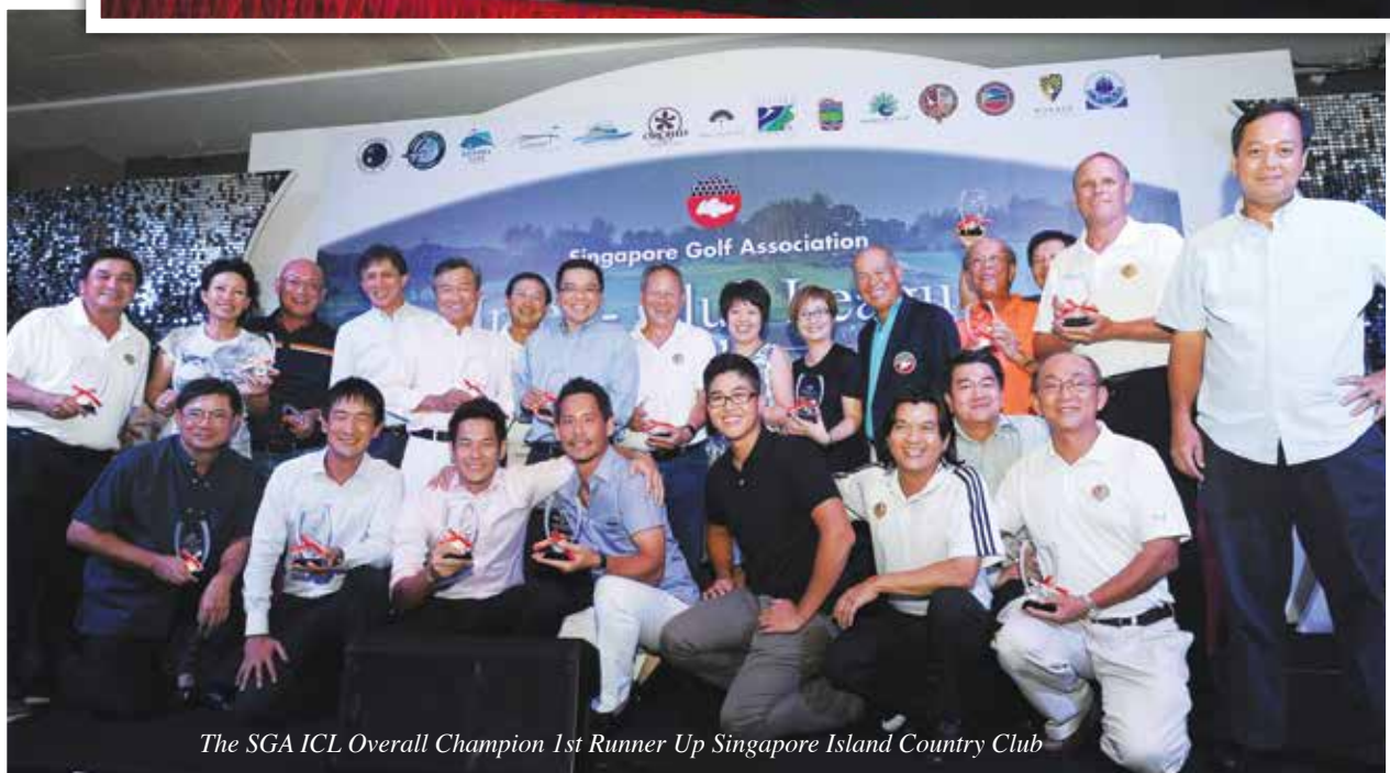
The SGA ICL Overall Champion 1st Runner Up Singapore Island Country Club