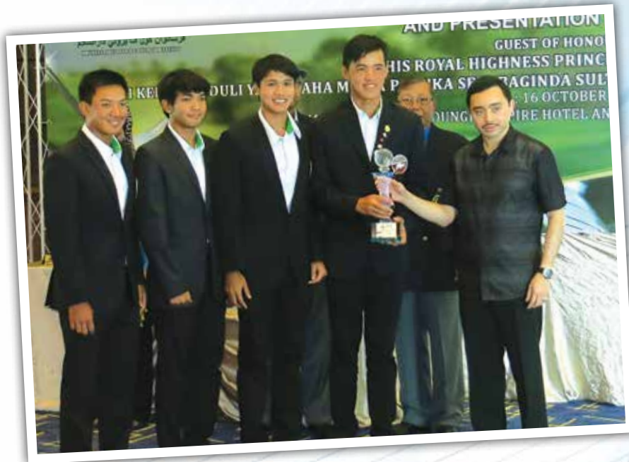
Team Singapore receiving the 1 st runner up Putra Cup trophy from His Royal Highness Prince Abdul Malik.

In the 54 th SEA Amateur Golf Team Championship (Putra Cup) hosted by Brunei at the Empire Hotel & Country Club from 11 to 17 Oct 14, we finished in 2 nd place behind winner Thailand. Malaysia finished in third position.