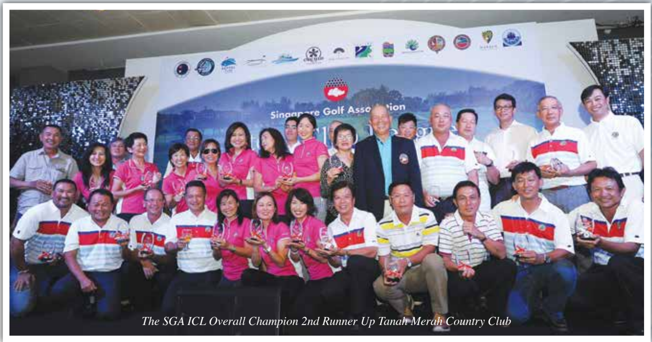
The SGA ICL Overall Champion 2nd Runner Up Tanah Merah Country Club

Trophies were also awarded by President SGA to winners of the SGA Inter-Associate Members' League during the prize presentation dinner.