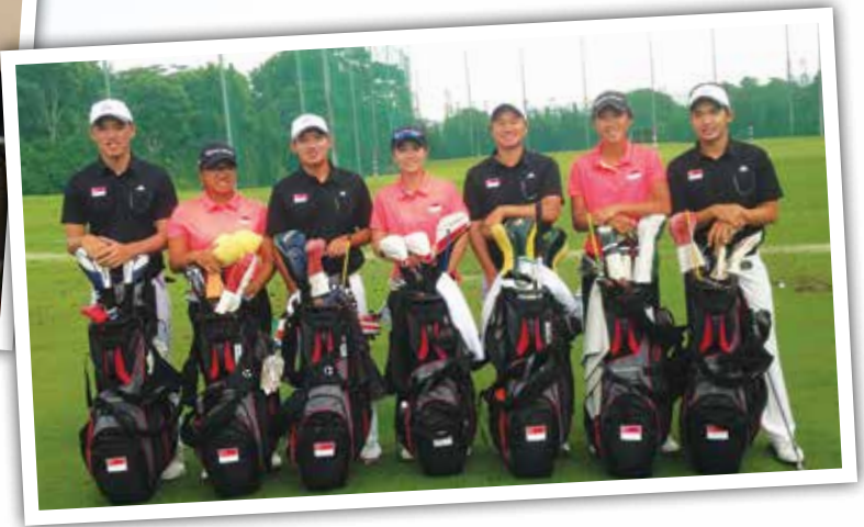
28th SEA Games team members in their TMaG attire.

TaylorMade-adidas Golf continued its support for SGA as the official apparel sponsor for FY 2014 as well as for the 28 th SEA Games. Squad members were presented their TMaG attire at the annual SGA Parents' Dialogue.