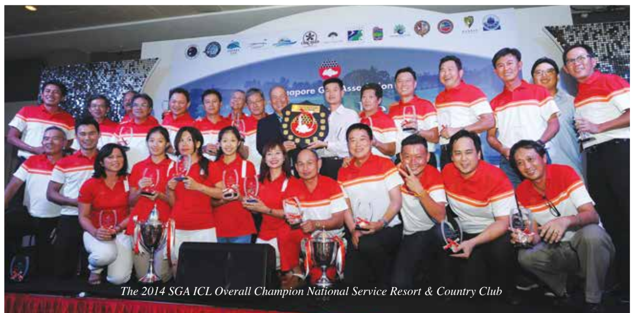
The 2014 SGA ICL Overall Champion National Service Resort & Country Club

The Overall Champion was NSRCC which amassed a total of 33 points winning 11 out of the 12 legs. This is NSRCC's fourth straight win since the new match play format was introduced in 2011. The Overall Champion 1 st Runner Up was SICC and 2 nd Runner Up was TMCC.