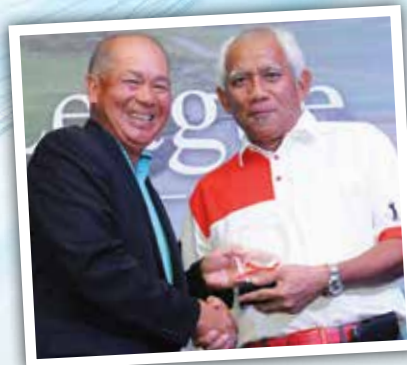
Society of Singapore Golfers – “D” Division Winner