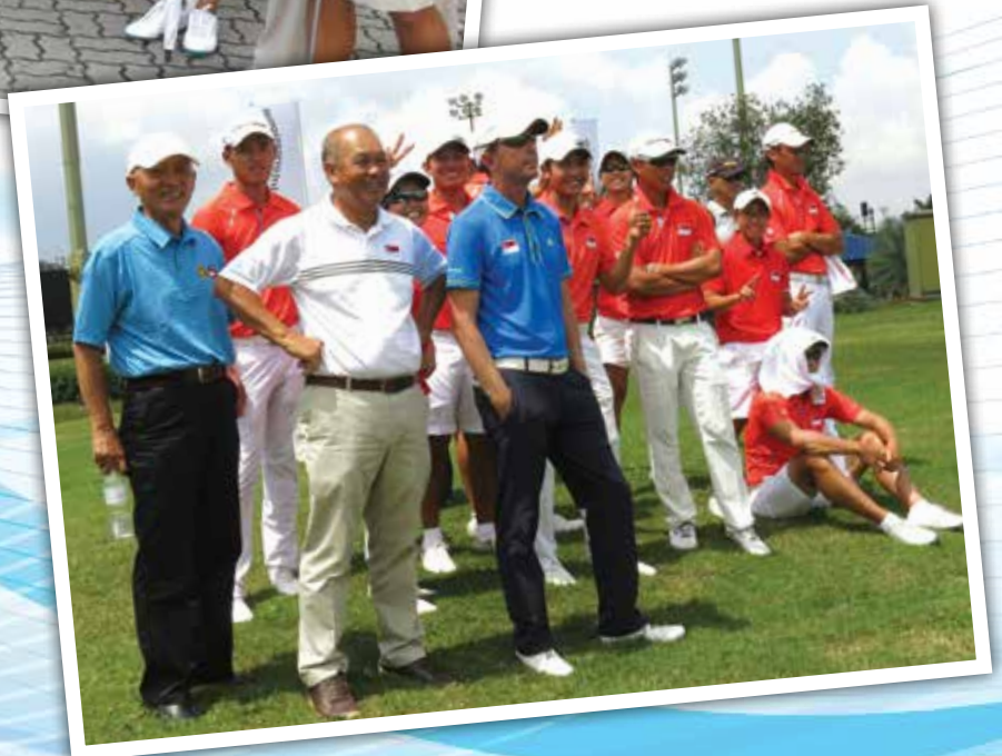
SGA team officials and players at the 18th green.