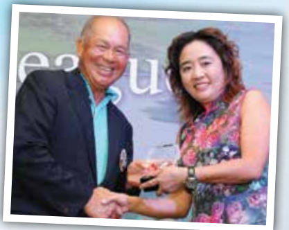
Acers Bon Club – “Ladies” Division Winner