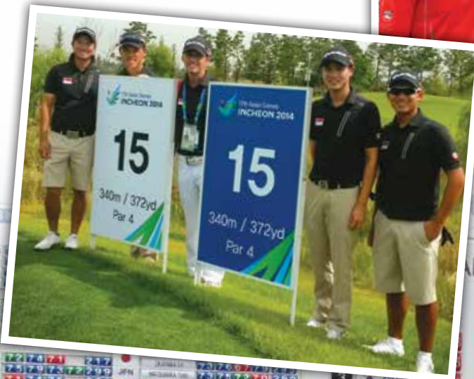
Team members posing at the 15 th Hole during the practice round.