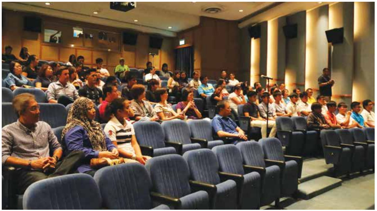
Parents and players