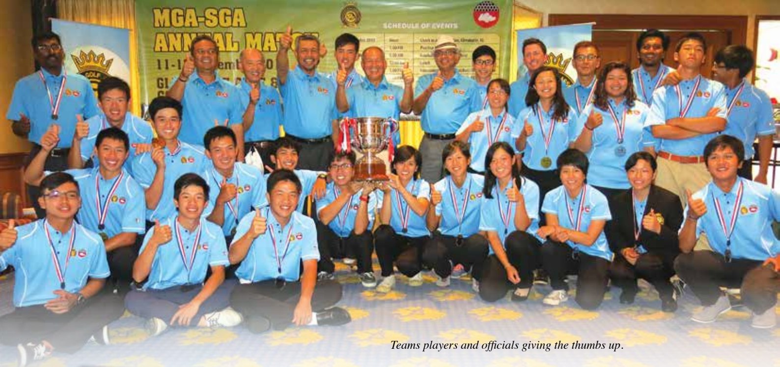
Teams players and officials giving the thumbs up.