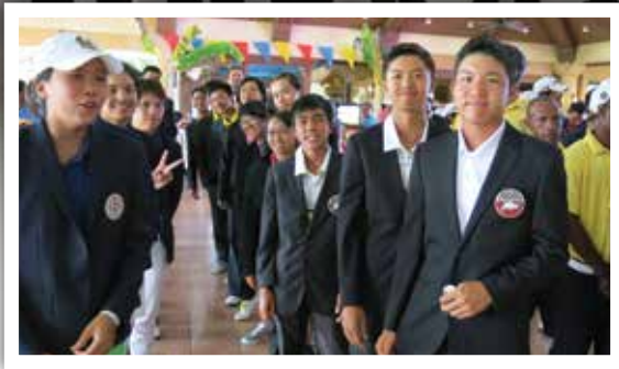
Team Singapore at the closing ceremony.