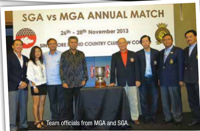
Team officials from MGA and SGA.