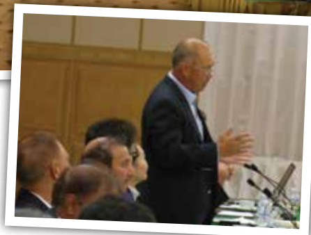
President SGA addressing the members.