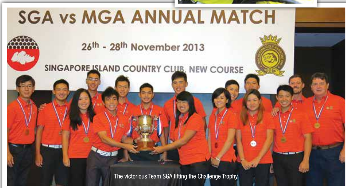
The victorious Team SGA lifting the Challenge Trophy