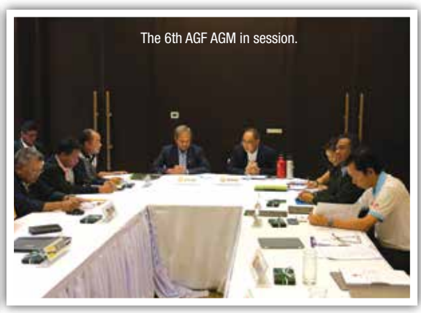
The 6th AGF AGM in session.