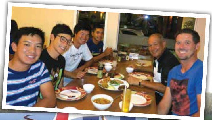
President SGA enjoying Thai dinner with the players.