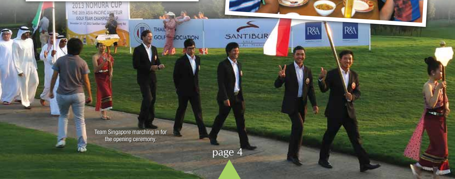
Team Singapore marching in for the opening ceremony.