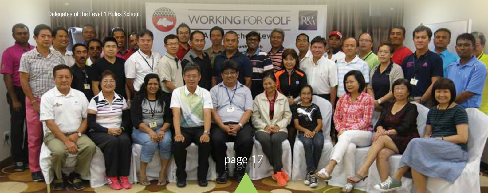
Delegates of the Level 1 Rules School.

This was followed by a Level 2 Rules School also conducted at Orchid Country Club from 3 – 5 Mar 14 with 21 local candidates. Candidates attending the Level 2 Rules School must have attended Level 1 first.