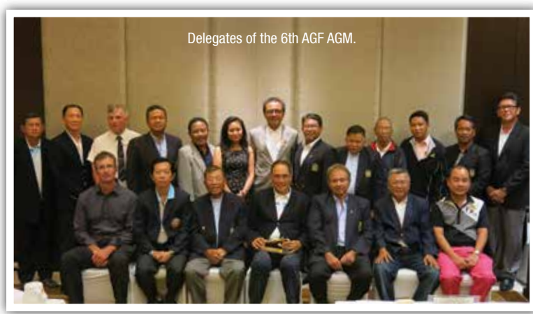
Delegates of the 6th AGF AGM.