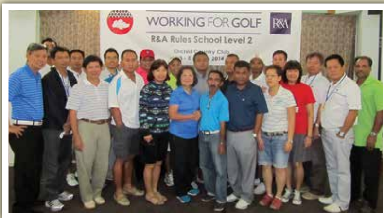
Delegates of the Level 2 Rules School.