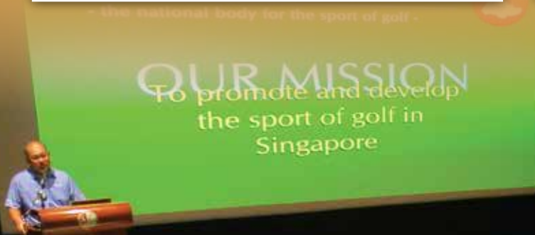
President SGA addressing the audience.

OUR MISSION To promote and develop the sport of golf in Singapore