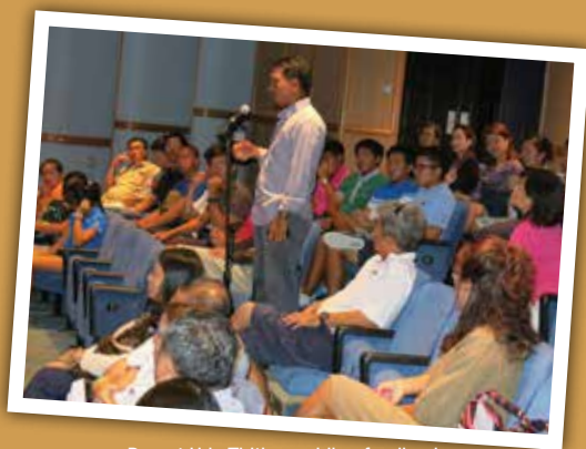
Parent Uda Thith providing feedback.