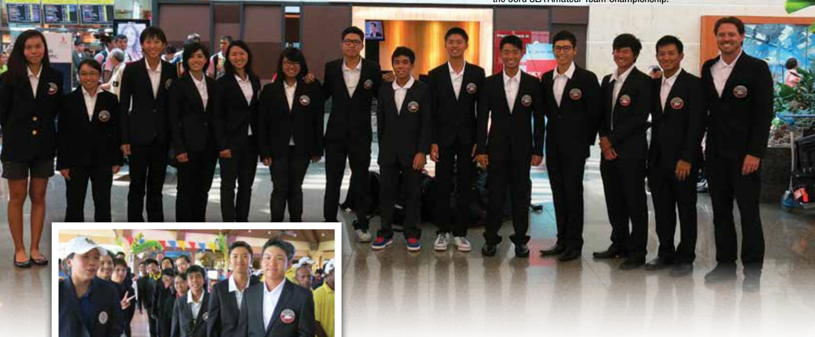
The complete Team Singapore members departing for the 53rd SEA Amateur Team Championship.