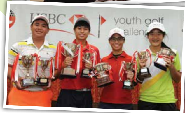
Division winners of the 2013 HSBC YGC 2nd Leg.