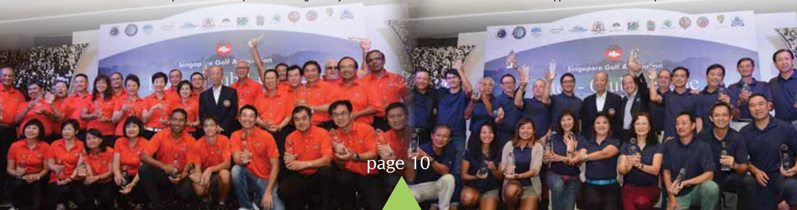
Team Keppel Club – Overall Champion 2nd Runner.