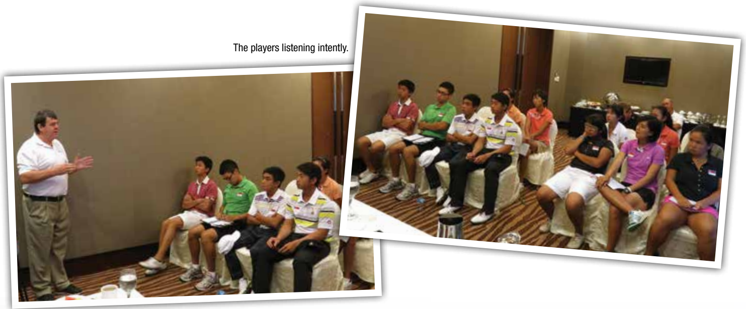
The players listening intently.

A follow-up session was conducted from 27 – 29 Nov 13 prior to the 27th SEA Games aimed at both the Men's and Women's SEA Games teams.