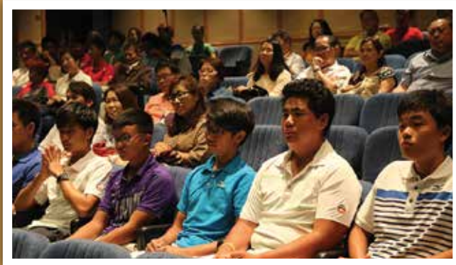
Players and parents at the dialogue session.